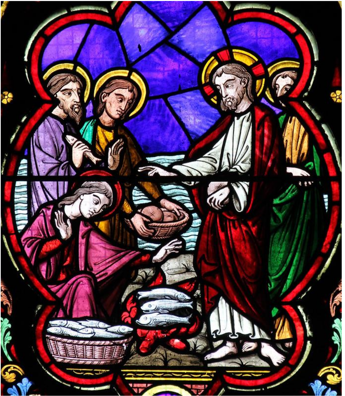
Detail from a stained glass window in Lille Cathedral, France